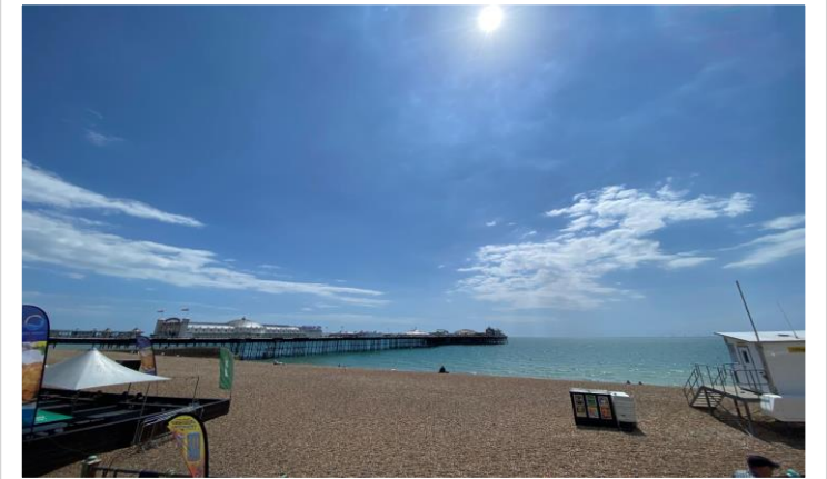
Day three - Brighton