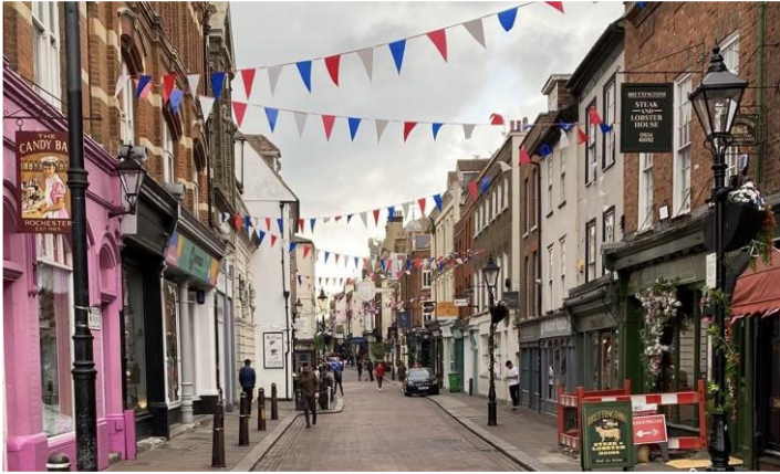
Day one - Rochester